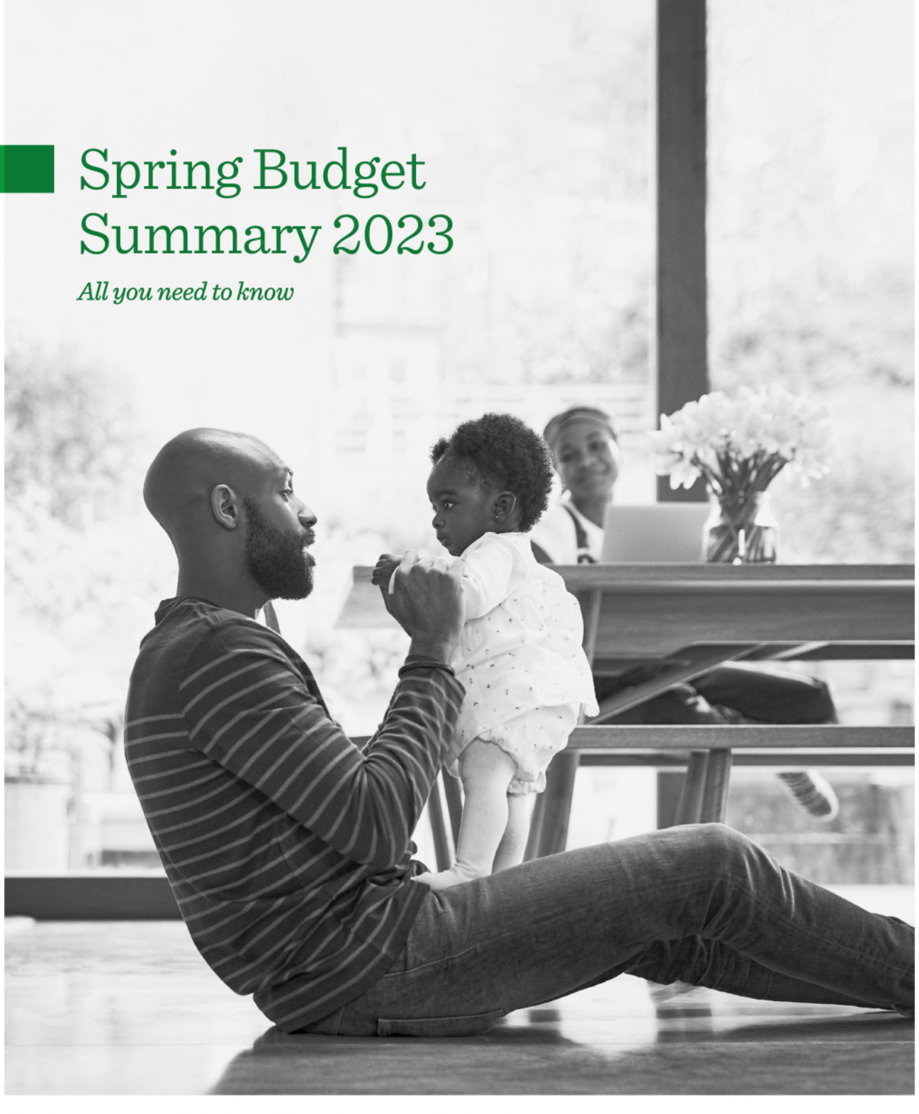
This Spring Budget summary briefing is provided strictly for general consideration only. The information contained in this briefing is based on Quilter Financial Planning's understanding of the relevant proposals contained within the Spring Budget 2023 (as of 15/03/23), which may change. For information only. Always seek professional advice before acting.